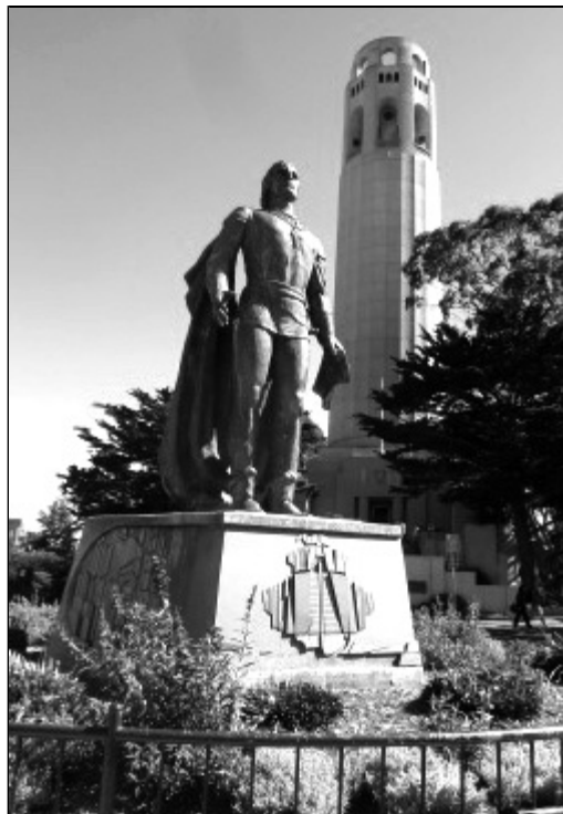
PHOTO ABOVE: UThe Christopher Columbus Statue at Coit Tower in San Francisco's North Beach overlooks the Pacific. Until Columbus voyage, the Pacific Ocean was unknown to the Europeans. The statue was removed during the hysteria of 2020.

In an effort to encourage more tolerance and acceptance of Italian immigrants, President Benjamin Harrison, declared a national celebration of Columbus Day in 1892.