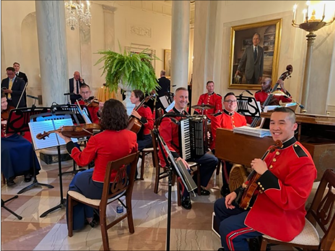
PHOTO ABOVE: The Marine Corp Band played Italian songs at the White House on Columbus Day. In 1805, Thomas Jefferson recruited 14 musicians from Italy to form the United States Marine Band.

First Lady Jill Biden hosted a delegation of Italian American leaders at the White House on Columbus Day, October 12, 2023, to celebrate the contributions Italian Americans have made to our country.