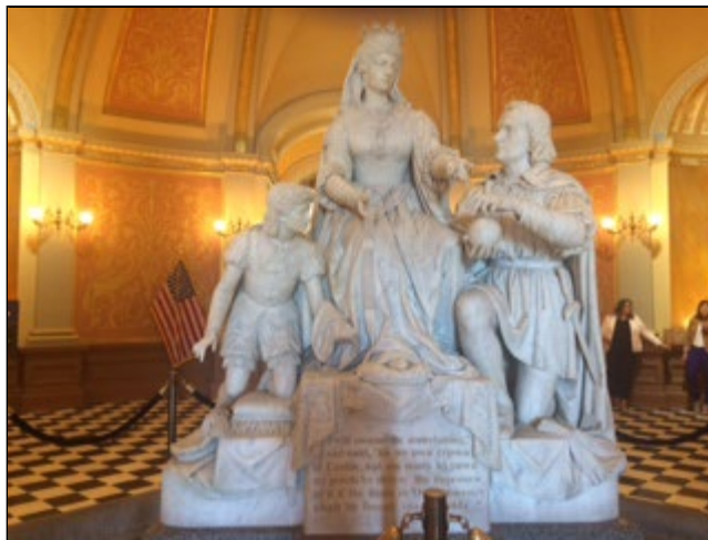
PHOTO ABOVE: The statue of Columbus and Isabella stood in the California State Capitol Rotunda since 1882 until it was removed in 2020.

CLICK TO READ Why Italian Americans Should Be In History Books