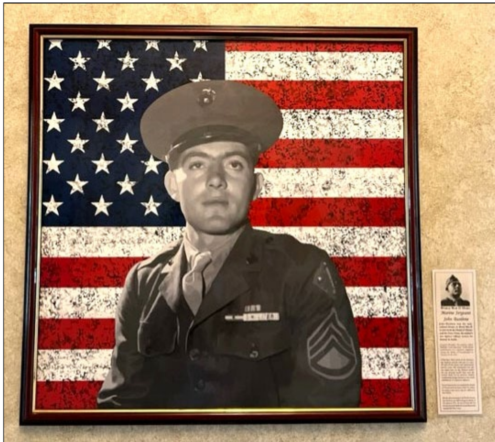
PHOTO ABOVE: This framed print of John Basilone is on display at the Italian Center in Carmichael, CA.

"I'm staying with my boys...." Is a firsthand look inside the life of one of the greatest heroes of the Greatest Generation. Sargeant John Basilone was lauded by General Douglas MacArthur as "a one-man Army" for his heroic actions on