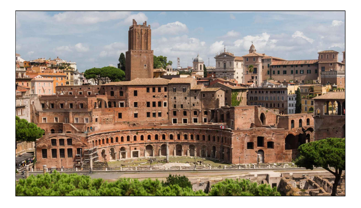
PHOTO ABOVE: The Trojan Market, the first 'indoor shopping mall' in the world.

Italy beat out France, which came in number two, and the United States which squeezed inro the number three spot.