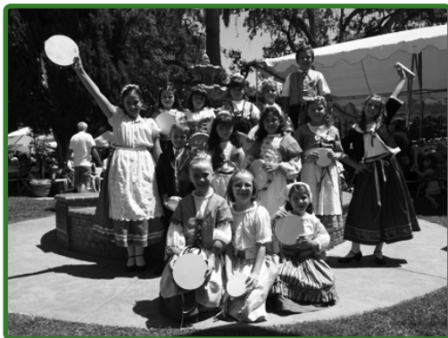
Bambini Dancers at Festa Italiana 2011